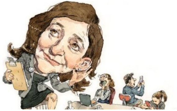
Saving the Lost Art of Conversation