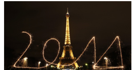
Happy New Year 2014